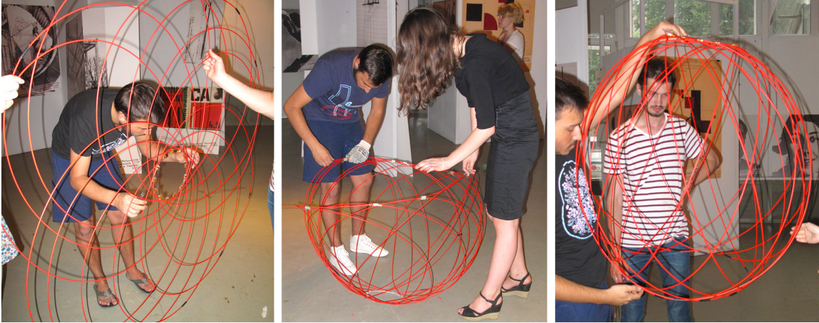
Figure 3: Fixing central and peripheral openings of the structure with rings and the final shape of model.

As a preliminary step we placed a ring in the center of the future structure and attached it to the floor to fix the central opening of the structure and tense it. Then we began the assembly of the structure, adding the modular elements of the knot, forming its loops and interweaving the modules according to the algorithm (Figure 2).