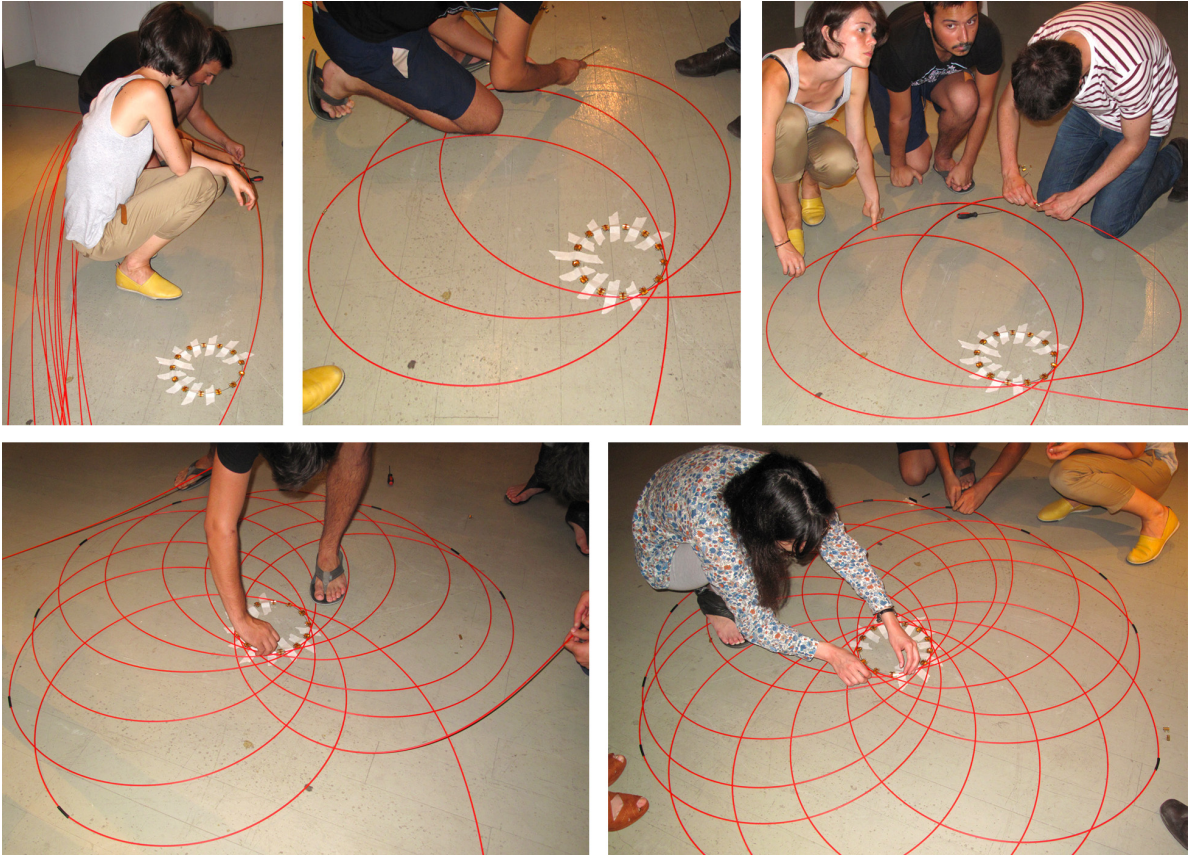
Figure 2: Process of algorithmically assembling of fiberglass wire modules into knotted structure.

was marked as plus (+) and minus (-) signs correspondingly. This sequence of over- and undercrossings was used as a reference guide to make the structure of the chosen non-alternating knot correctly.